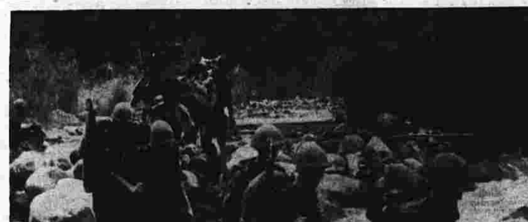
A detachment of United States troops crosses a stream somewhere on the distant New Guinea battle front.

Settlements Retaken by Reds; Nazi Fail to Gain Initiative